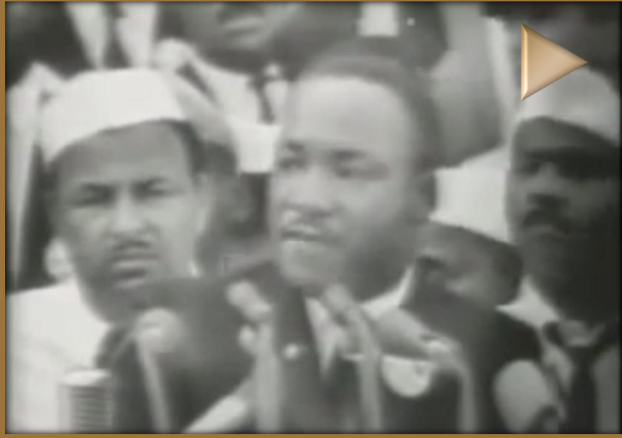
Excerpt: "I Have a Dream" (1963)

"Who Taught You to Hate Yourself?" (1962)